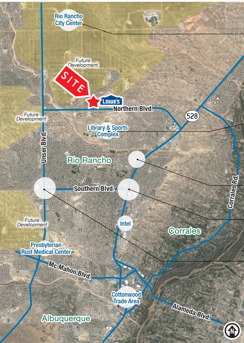
Rio Rancho City Center