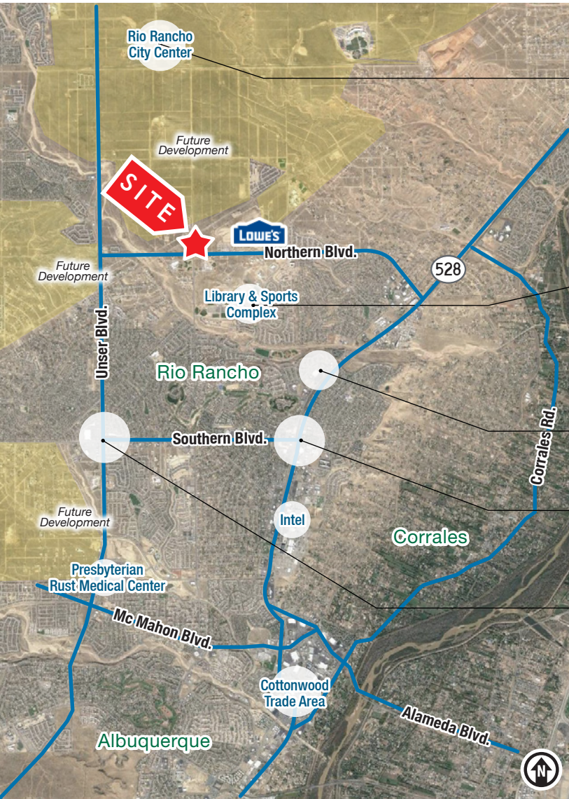
Rio Rancho City Center