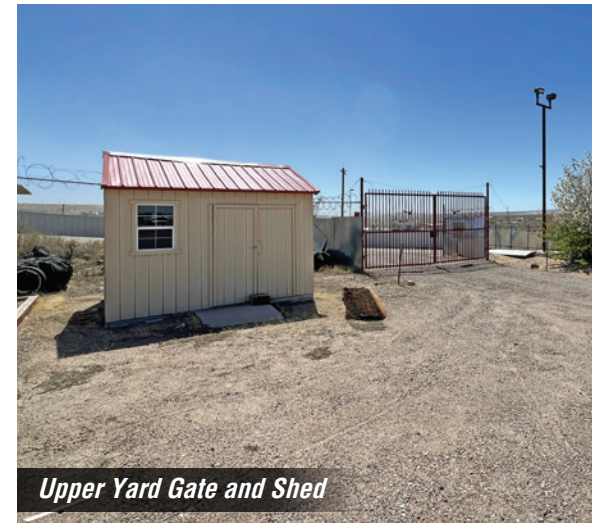
Upper Yard Gate and Shed