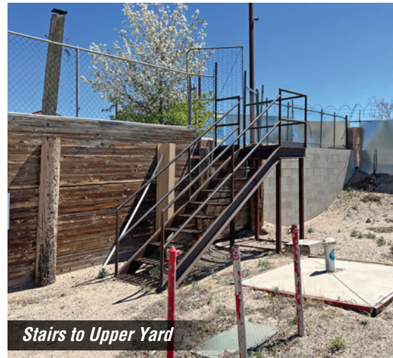
Stairs to Upper Yard