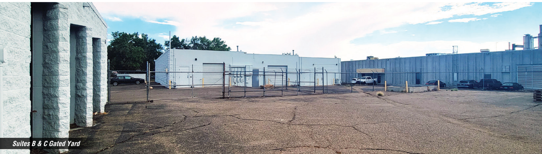
Suites B & C Gated Yard